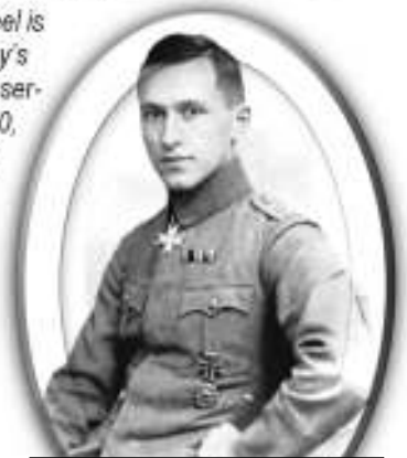
Born in 1895, Jünger died in 1998 at the age of 102. He flatly refused to ever join the Nazi party.

About the Book: Storm of Steel is the memoir of imperial Germany's Prussian officer Ernst Jünger's service on the Western Front during the First World War. In 1920, Jünger privately published an almost unedited version of the war diaries he had kept from August 1914 to August 1918, when his seventh battle injury caused retirement from the field. Known for graphic descriptions of trench warfare, the bestselling work has been revised many times. Based on the final 1961 version, a new English translation was made by Michael Hofmann in 2003, winning the 2004 Oxford-Weidenfeld Translation Prize. Each edition has carried the dedication "To the fallen."